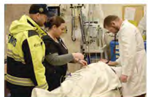
EMTs, nurses, and physicians know the importance of working together to provide the best patient care possible.