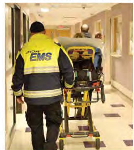
LifeCare EMS works side by side with LifeCare Emergency Department staff to provide patient centered care.

This trained Emergency Medicine physician is providing a fresh look at current emergency processes, according to Okeson. "Our plan is to equip all our physicians