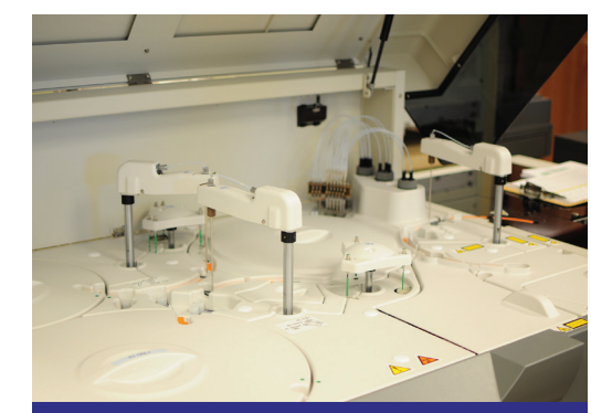
A look inside the new lab equipment.