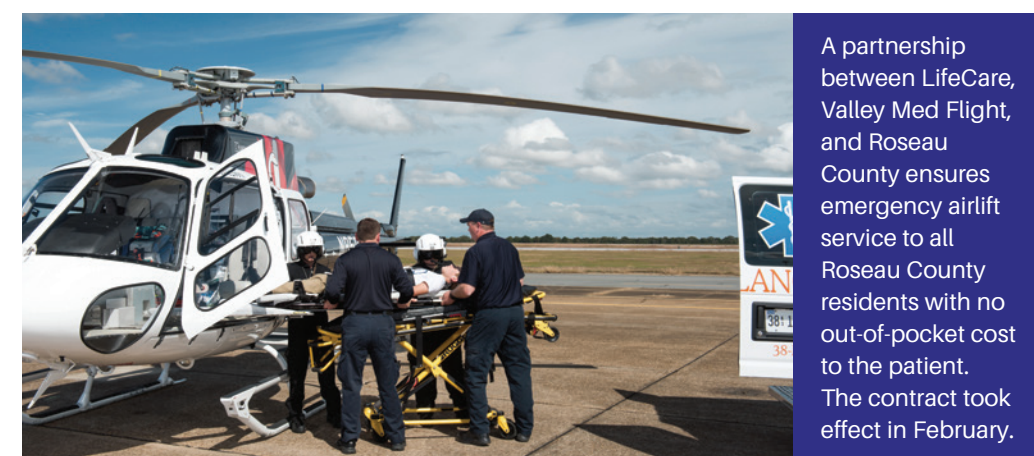
A partnership between LifeCare, Valley Med Flight, and Roseau County ensures emergency airlift service to all Roseau County residents with no out-of-pocket cost to the patient. The contract took effect in February.

Thanks to a partnership between LifeCare Medical Center and the county, every Roseau County resident now has access to emergency air medical transport with no out-of-pocket cost to the patient.