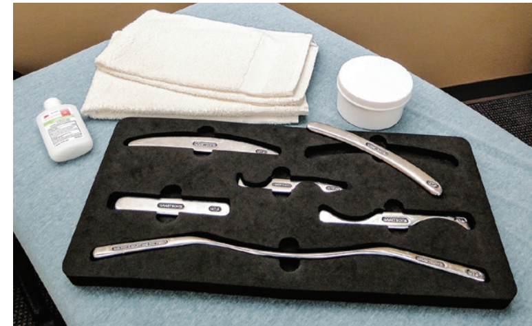
A set of stainless steel instruments sits alongside other items used as part of the Graston Technique. Applied directly to the skin, these instruments are used to treat a variety of soft tissue disorders.

The need for Graston Technique healing begins when the body experiences any soft tissue trauma.